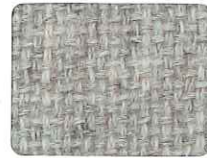
7021 GREIGE PAPIER