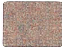
7003 ROSE QUARTZ