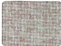
7012 SILVER NEUTRAL