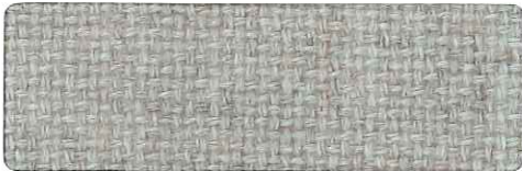
7023 VERTE PAPIER