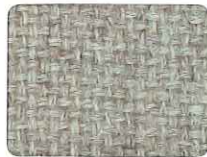
7016 GREY MIX