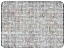
7026 BLUE PAPIER