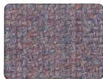
7027 PURPLE MIX