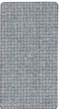
7010 CRYSTAL BLUE