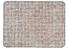
7015 LAVENDER NEUTRAL