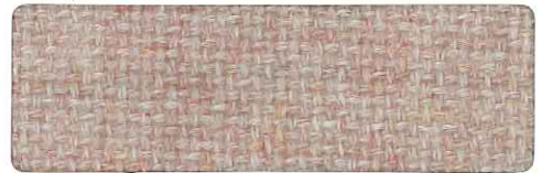
7004 CHERRY NEUTRAL