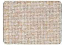
7001 APRICOT NEUTRAL