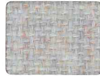
7011 BLUE NEUTRAL