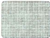
7025 SILVER PAPIER