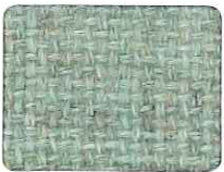
7013 GREEN NEUTRAL