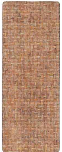
7549 CORAL NEUTRAL