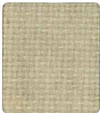
7555 TEA LEAF