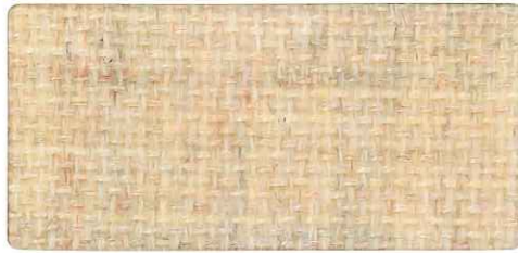
7558 CREAM NEUTRAL