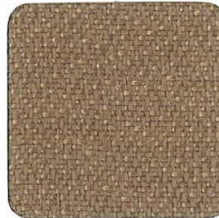
Winter Birch Taupe 15-17D