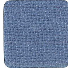
Cascade Blue 15-06D