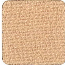
Sand Dune 15-09D